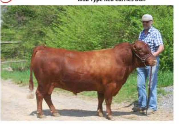
Ragfime ADCA #046330 Homoz. Polled, A2/A2, KC B/B, BL A/B, Carries Red and Dun

ADCA #043169 Homoz. Polled, A2/A2, KC A/A, BL A/B, Wild Type Red Carries Dun