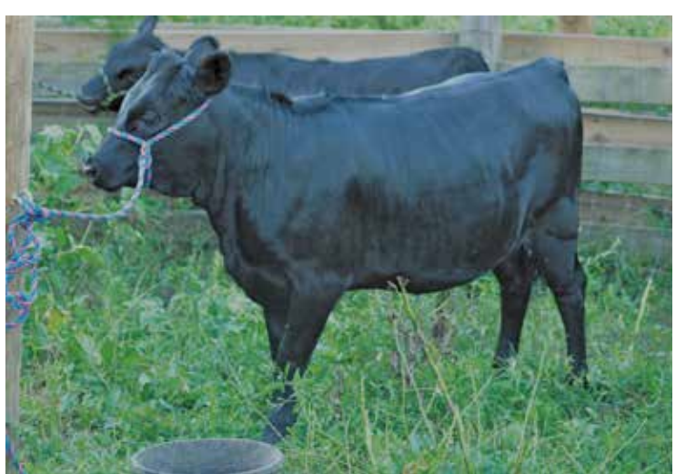
On average it take the calves two to three days to learn that staying in my space is a good thing and that any acceptance of pressure of the halter is followed by instant release and very often a treat. That's when I feed them at the posts and tie them while they eat. This can be tricky and some calves will throw a fuss, so I never leave

them unsupervised. I'm asking them to be patient and accepting, which, for some, is hard. It's also smart to keep an eye on the knot and the length of the rope and redo and adjust.