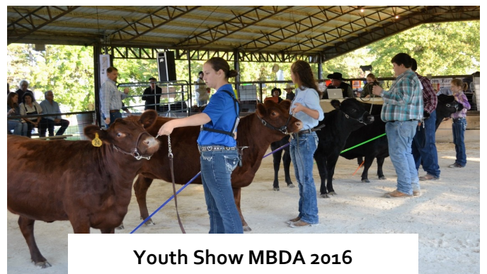
Youth Show MBDA 2016