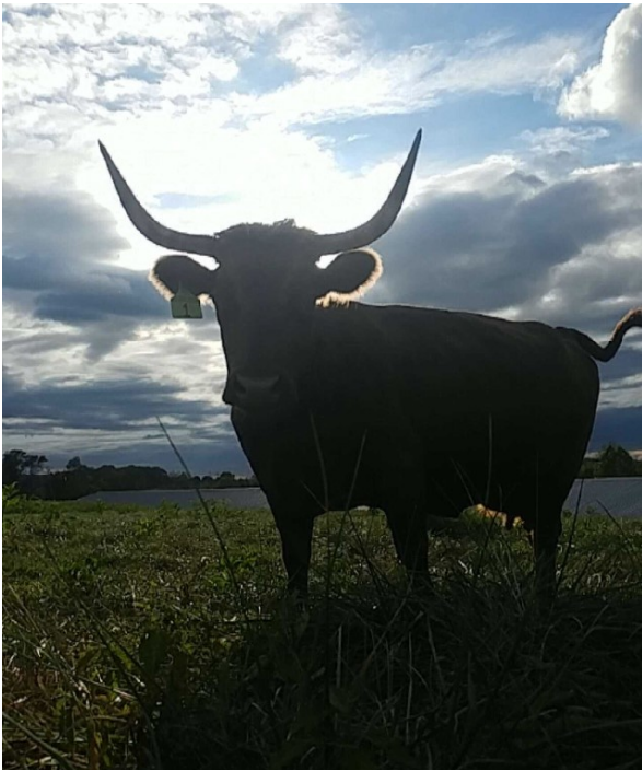
Poplin Farm Dexter Jonesville North Carolina Lead cow Woodcrest Cinnamon on guard. Nothing escapes her watchful eye.