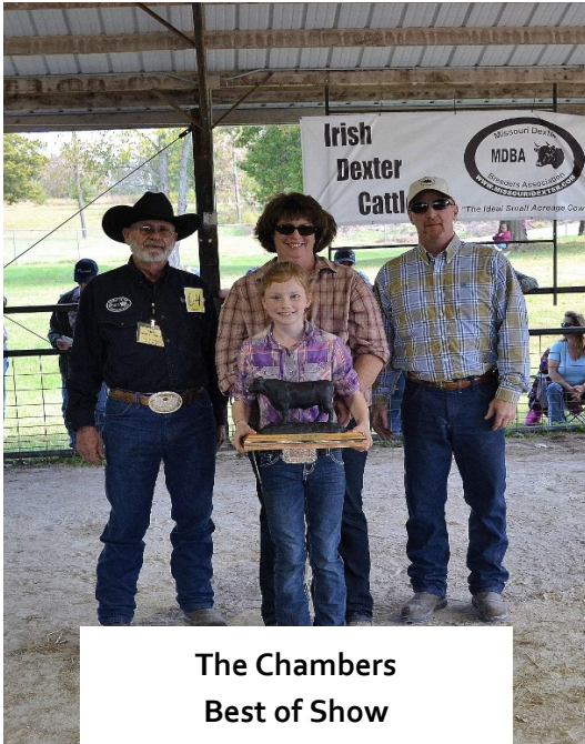
The Chambers Best of Show