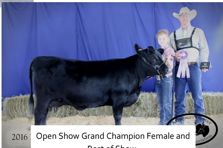
Open Show Grand Champion Female and Best of Show.