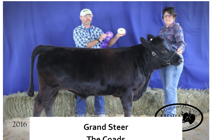
Grand Steer The Coats