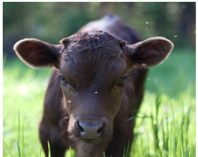
Fairland Blu - 1 month old

I believe we're on the cusp of a farming revolution. Farms that feed their own families with their own homegrown food are growing in number. Continues on page 4