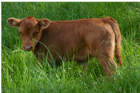
New Staleybrook bull calf