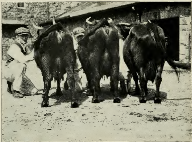
FIG. 6. Rear view of cows in Fig. 7, standing in same relationship as below.