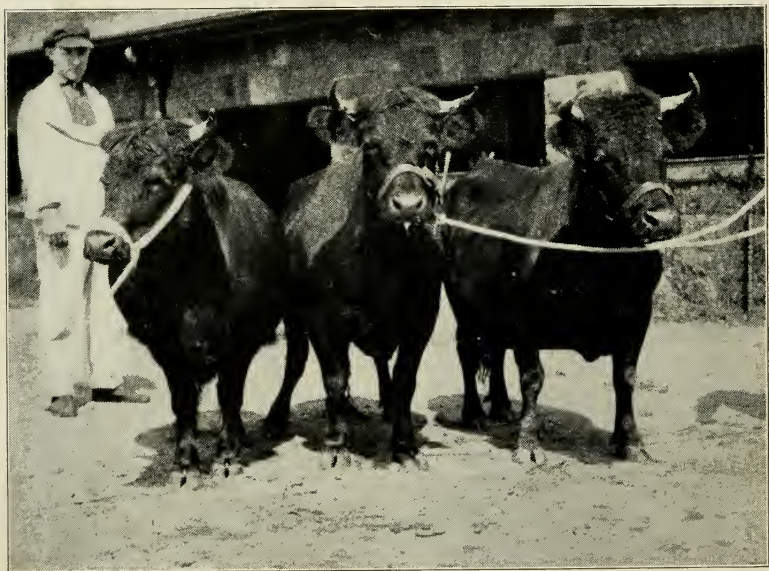
FIG. 7. Three Dexter cows at Hempstead House. Reading from left: Belle of Hempstead House, Victress of Hempstead House and Castle-gould Minda.