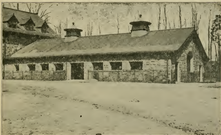
A view of one of the stables at Hempstead House, Port Washington, Long Island, New York.