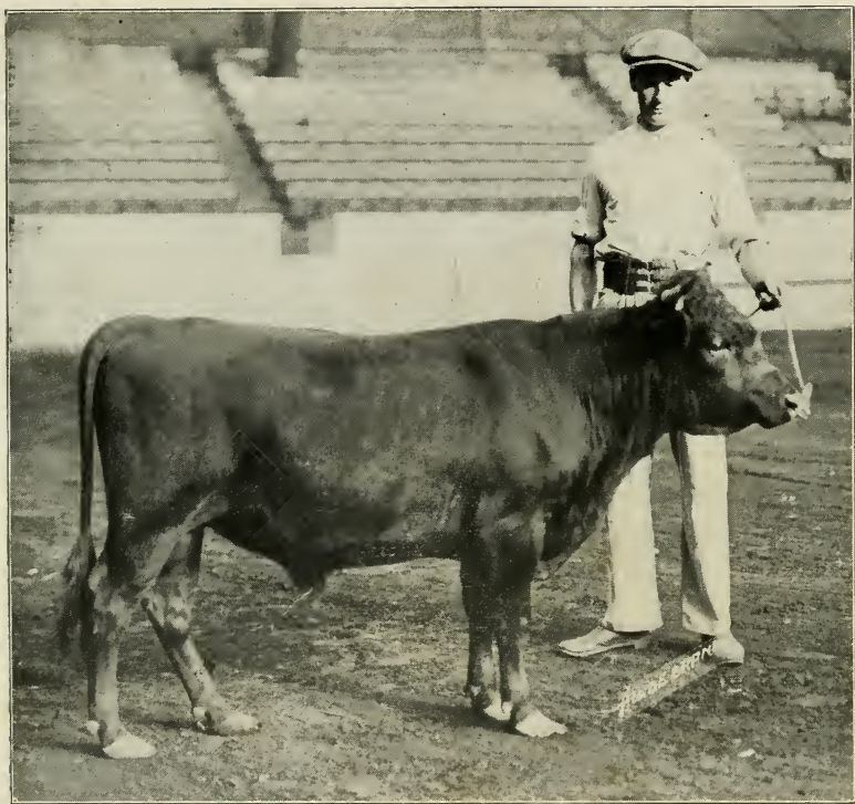
FIG. 3. Gort Hero 3d 6[578 R. D. S.]. Sire, Gort Hero 2d [274 R. D. S.]: dam, Gort Sunbeam 2d. 24[5285 R. D. S.]. 1st prize two year old Dexter bull at National Dairy Show, 1911. Owner, Elmendorf Farm, Lexington, Ky.