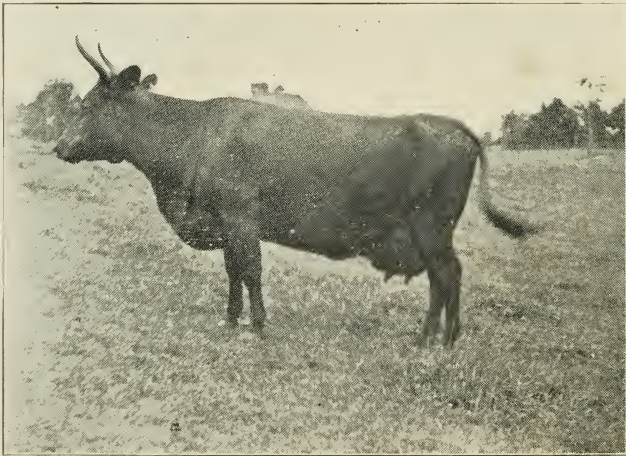
FIG. 2. Kerry cow, "Gort Dainty" 3d (1579) [3480]. First prize and winner of Blythwood Bowl, Royal Dublin Society Show, 1913.