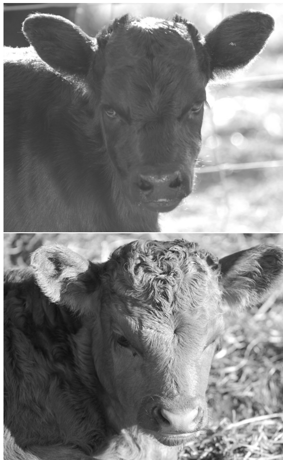
Meet Sheza 10 (top) and Heza 10, born at Freedom Farms on that special 10-10-10 date.