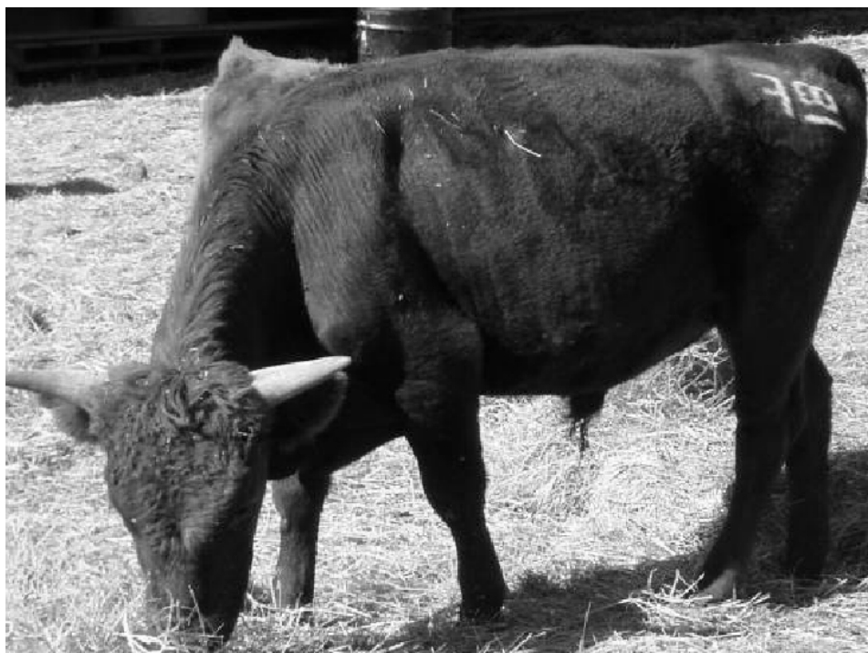
Check out this Dexter freeze-branded with the Colorado brand!

I'm sure most of you do not find it necessary to brand and may not be familiar with freeze branding as opposed to hot branding. It's really quite simple. The branding iron is placed in a solution of 99-percent alcohol and dry ice. Once it has