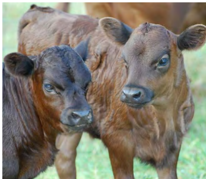
FF Mr. Popularity (Pops) and FF O'Finally O'Phelia (Phee-Phee), at home at Freedom Farms, Louisburg, N.C.