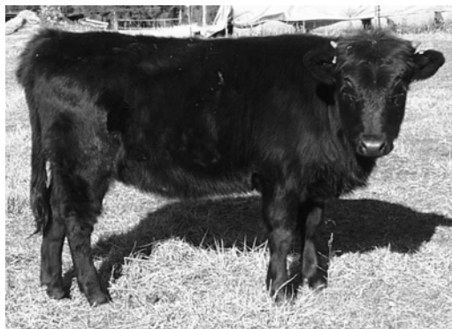
May 2007 Heifer

Visit http://www.cals.ncsu.edu/an_sci/extension/animal/4hyouth/jbru06.htm for a complete list of results.