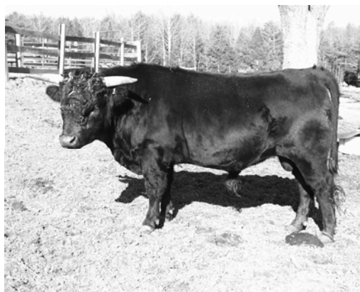
March 2006 Bull