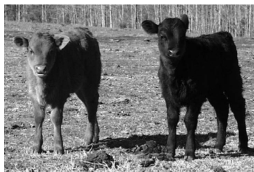
December 2007 Heifers

Olde Towne Farm is pleased to offer these fine Dexters for sale. More calves are due in the spring and fall of 2008.